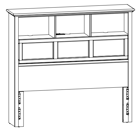
Thank you for allowing us to help you furnish your home. We are certain you will be delighted with your new furniture for many years to come.

FST = Fieldstone finish Assembly Instructions