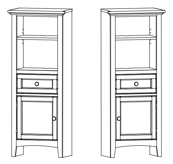
Thank you for allowing us to help you furnish your home. We are certain you will be delighted with your new furniture for many years to come.